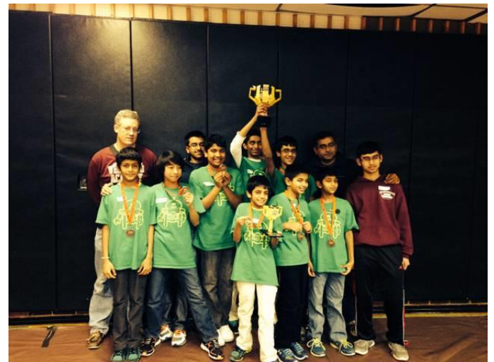
Westford 4-H Youth Robotics Club Green Stormgears proudly showing their 2013 State Championship Trophy and their 2 nd Place World Champion Mechanical Design Trophy. They were ranked 21 st Overall in the World!